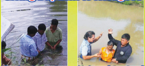
Obedying Great Commission of Our Lord.