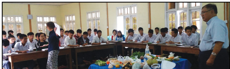
CHE Classroom Training