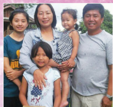
Moses family Helping Refugees