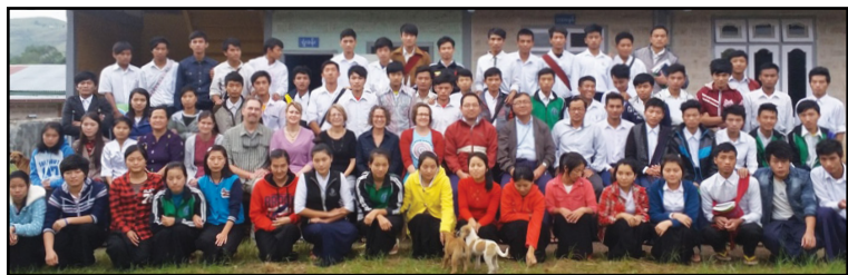
TBC Faculty and the students with FAME Team