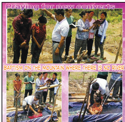
BAPTISM ON THE MOUNTAIN WHERE THERE IS NO RIVER