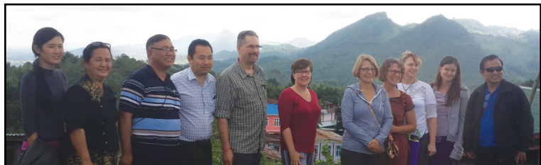
FAME Team at Taunggyi