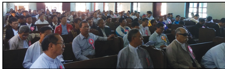
Church Annual Meeting