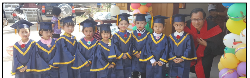
Grace Preschool Graduation