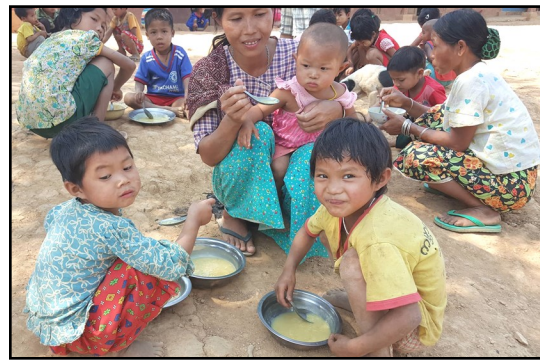
Feeding the Hungry

We have come back to our comfortable and comparatively easy life having been stretched and encouraged because God is moving in huge ways. It occurred to us