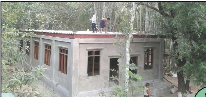
Hope Preschool and Church (about 90% finished)