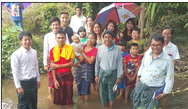
Joy in New Believers

are fantastic. Two New ACS Board members experienced extensive visits. Partner missions FAME and IDES were also in Myanmar. Our ACS workers gave helpful support. And, another STADIA preschool/ Church was planted and dedicated in a Buddhist community.