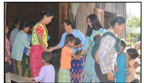
Farewell handshaking at Leh Pan Thar