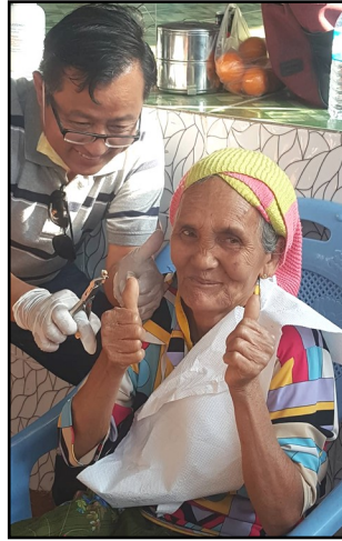
Providing Dental Help

But there is also a sobering reality that remains vivid for me. The physical and nutritional needs of SE Asia remain real. The reminders of malnutrition and disease and human trafficking and drug use are everywhere. The spiritual needs are also very real. Eighty-five percent of the people of Myanmar profess to be followers of Buddha and do not yet know Jesus. Of the 135 -140 different tribes that claim Myanmar as their home some of those tribes have yet to hear a proclamation of the power and saving love of Jesus Christ.