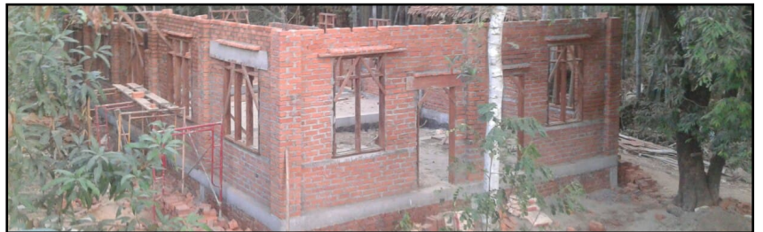
Building the Hope Preschool Church