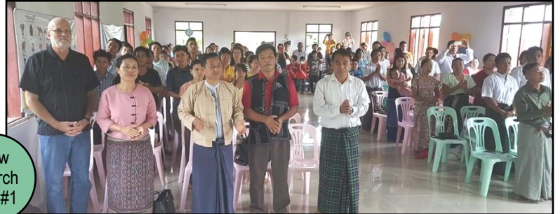
Grace Dedication Service