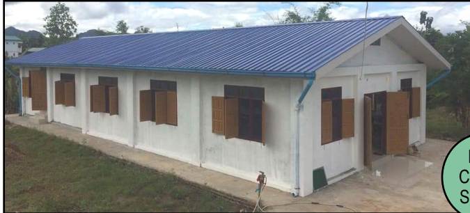
Grace Christian Church Building

Our Joint Mission: To spread the gospel through the formation of 10 new churches in new, multi-functional church buildings that serve as weekly preschools for the communities and as weekend church buildings.