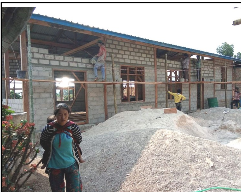
May Zele Church Construction