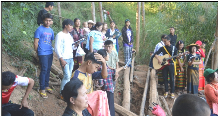
Praising at the Baptism Site