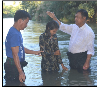
Baptism at the Funeral