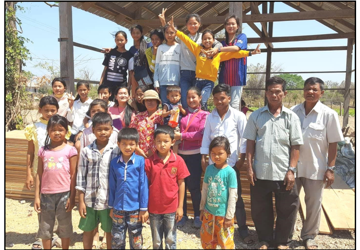
Laos Children's Mission