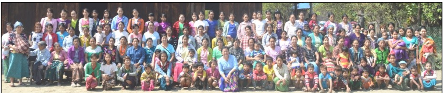
The 3rd Naga Women's Seminar in Khamti