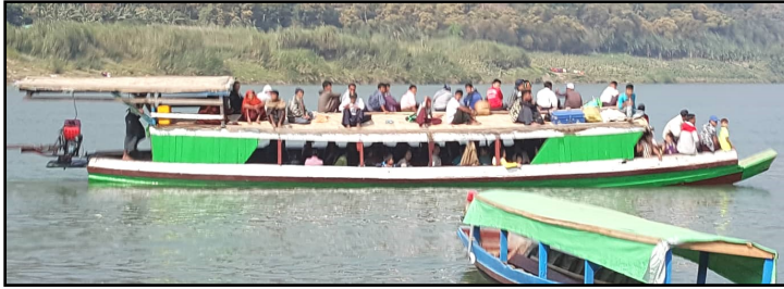
Traveling west to the KhongSo

TRUST GOD'S PROTECTION 100% -There were explosions in 3 places in western Myanmar where we planned to go for a mission trip. We almost cancelled the trip.