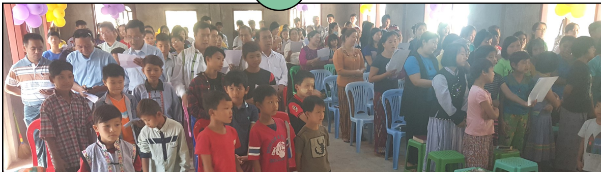
Hope Dedication Congregation